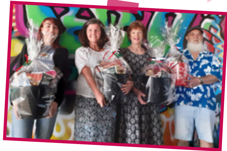
The Ashburton Team with Buckets of Blessings donated by New Life Church.

Our sincerest gratitude goes out to all who made this possible, including Rangi Ruru Girls School, 2 Degrees Christchurch, Duncan Cotterill, Lincoln Union Church, Alpine Church, St Ninian's Church, Riccarton Ladies Group, Greame Dingle Foundation, Cashmere Presbyterian Ladies Group, New Life Church, Northlands Mall, and the Rotary Club of Papanui.